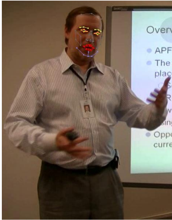
Figure 1: Example of face tracking.

were not allowed to bring notes during the presentation. In Task D and E, the participants were given no preparation time. They would start speaking as soon as they were given the topic of the impromptu speech. Before each recording, the speaker was asked to clap, which served as a signal synchronizing the multimodal data. Data from 3 speakers were lost due to equipment failure. In total, we obtained 56 presentations from 14 speakers (4 per speaker) with complete multimodal recordings. After getting raw recordings from our lab sessions, the motion and video data streams were synchronized.